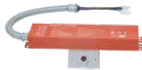
PT-EM1-15W LED Emergency Driver