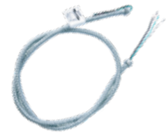
MC-5W-SC-6F MC-6W-SC-6F MC Cables