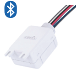
PT-BTC-6 6A Bluetooth Power Pack