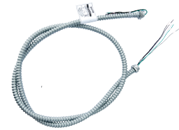
MC-5W-SC-6F / MC-6W-SC-6F(Screw-in) MC-5W-SN-HD-6F / MC-6W-SN-HD-6F(Snap-in) 6FT 5 Wire MC Whip / 6FT 6 Wire MC Whip