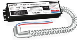
PT-SDT-325 325 VA Step Down Transformer (For PT-LHTL-185-2C3P)